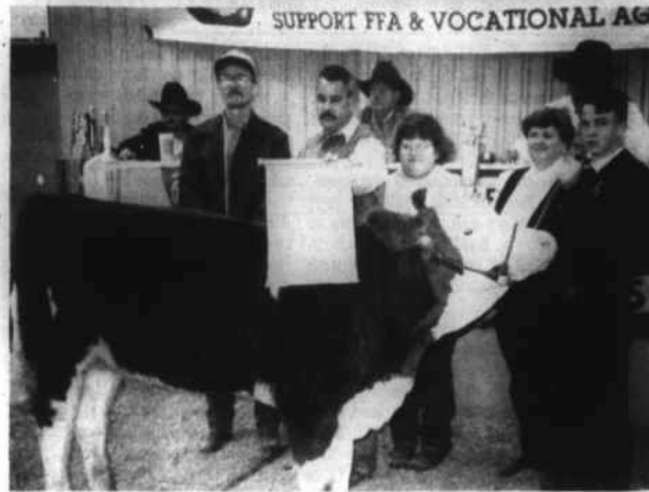
Grand Champion Heifer