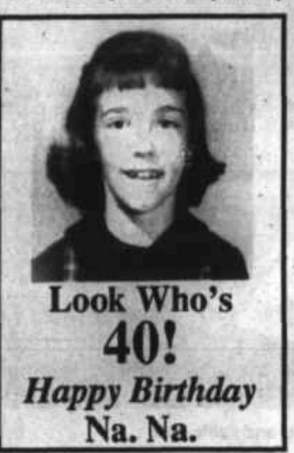
Look Who's 40! Happy Birthday Na. Na.

With U.S. Savings Bonds, the more you give, the more you receive.