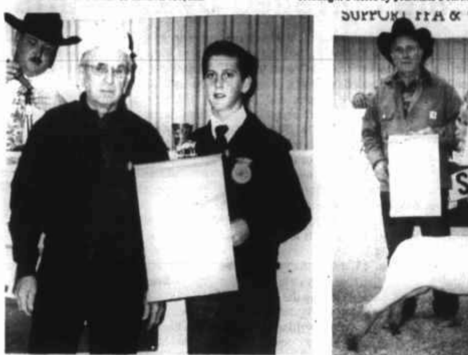
Grand Champion Hog