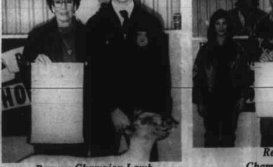
Reserve Champion Lamb